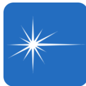
Visual fault locator 可视故障定位器