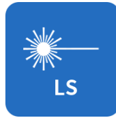
Laser Source 红光源