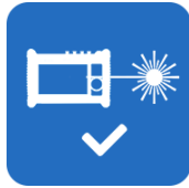
Optical signal detection 带光测试