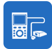
UTP Cable test UTP 电缆测试