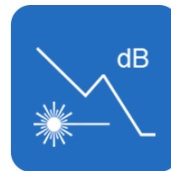
Loss test 损耗测试